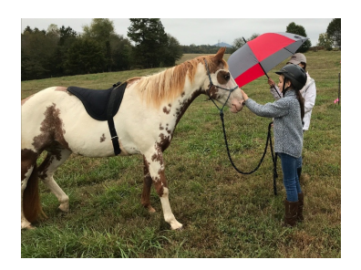
Steadfast: Year 2 at a Glance